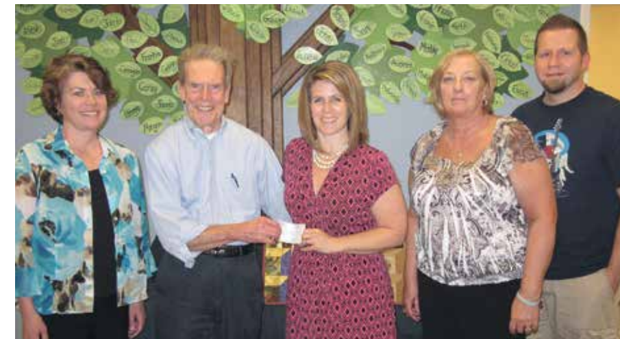
Spring 2015 | Issue 1